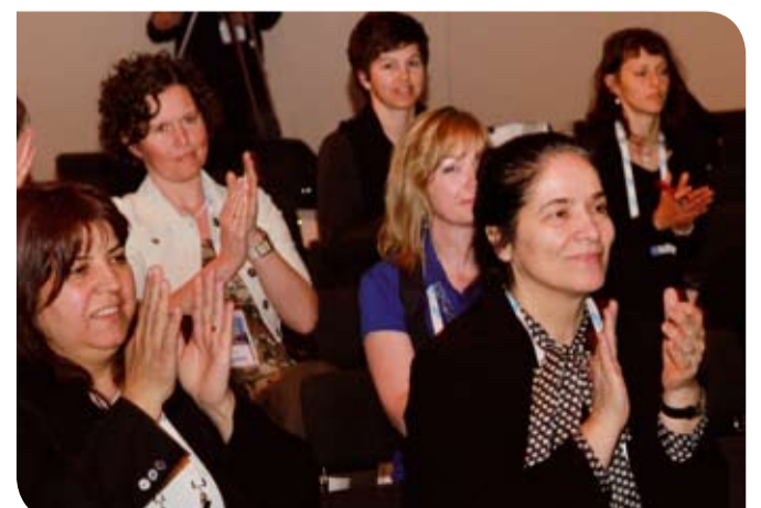
Enthusiasm for the award winners