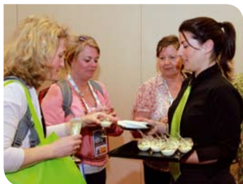
Opening day reception

The Hollister-sponsored workshop "The ins and outs of intermittent catheterization" by D. Newman was very informative. Presented with a focus on US-based practices, the lecture pointed to a lot of similarities with Europe, but also differences. The latter were mostly about insurance and the way nurse practitioners are working in the USA.